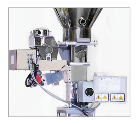
Optional metal seperator

Purchasing a complete HyCAP™4 system with an integrated Husky mold offers a more comprehensive system that is more productive and easier to use.