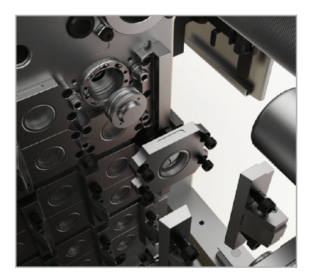
Front Mounted Cavities™