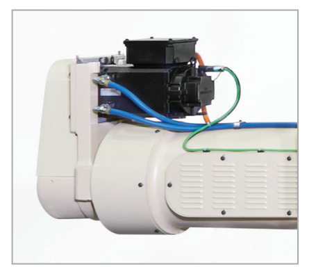
Electric Mold Stroke™