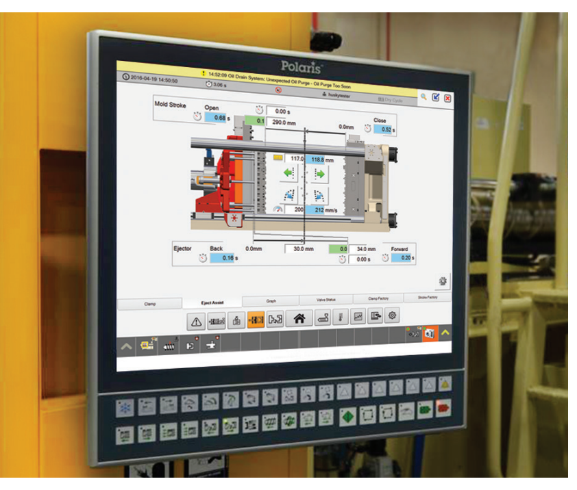
HyCAP™4 is equipped with a large 19–inch touchscreen display for simplified navigation